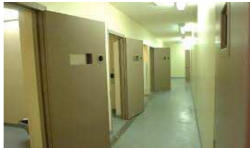
Local Crime Teams