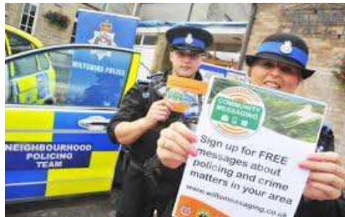
Neighbourhood Policing Teams